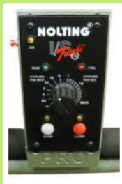
IS TURBO CL Stitch regulator