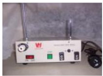
Bobbin winder for both "L" or "M" sized bobbins

The Nolting commercial steel frame. We deliver the machine and frame to your home and provide setup, testing and training. Along with this you get a free bobbin winder, extra bobbins, oil, patterns and a free day of training by our professional quilting trainers.