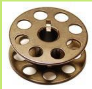
Add "M" sized bobbin and hook assembly for $350.00

IS Turbo CL stitch regulator with needle down button (white) laser on/off (red) stitches per inch dial and speed dial. Controls on both front and back of the machine !